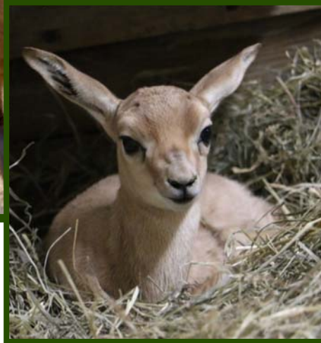
1.0 Slender-horned oryx Born: 16 Mar 18 Blank Park Zoo