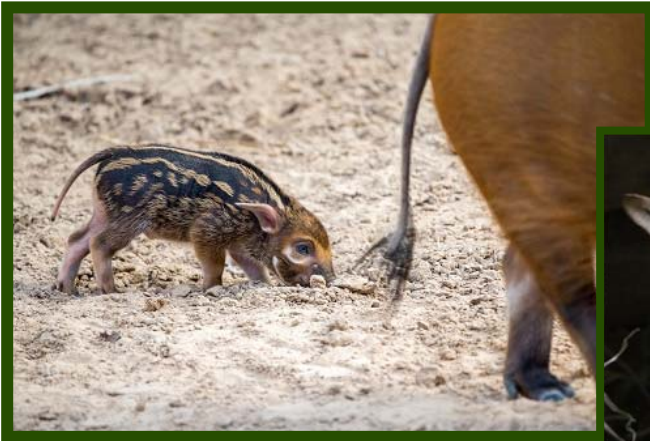
0.0.1 Red River hog "Shallot" Born: 9 Apr 18 Houston Zoo, Inc.