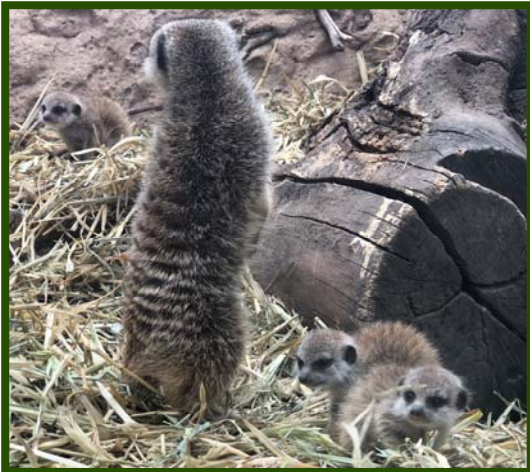
0.0.4 Slender-tailed meerkats Born: 6 Mar 18 Cheyenne Mountain Zoo