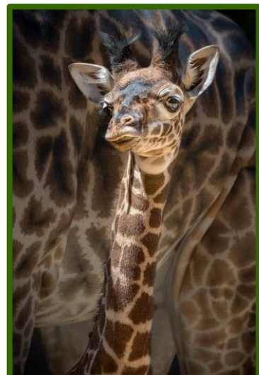
O.O.1 Giraffe DOB: Oct 5, 2019 @ LA Zoo