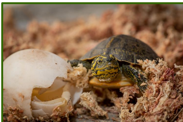
Yellow-headed temple turtle ( Heosemys annandalii ) DOH: Nov 1, 2019 @ Columbus Zoo First ever hatched in an indoor zoological environment for this most endangered species on the planet.