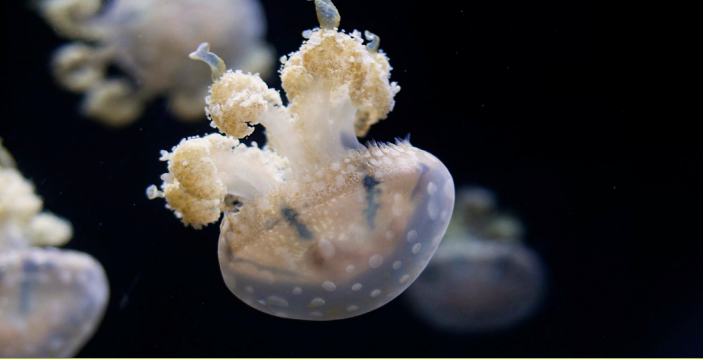
Upside-Down Jelly