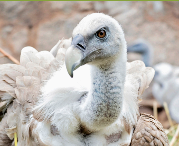
Eurasian Griffon Vulture / Cheyenne Mountain Zoo