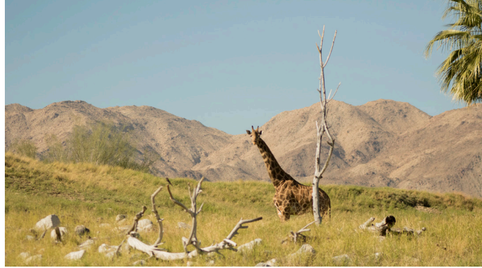
Reticulated Giraffe / The Living Desert

Visit zooregistrars.org to register or learn more.