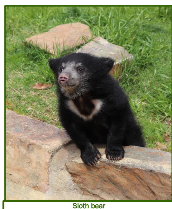
Sloth bear DOB: Jan 1, 2019 @ Little Rock Zoo